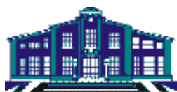
Symmetry Festival venue National Museum "Earth and Man" Sofia, Bulgaria

The World's Largest Multidisciplinary Scientific & Art Festival in Symmetry Studies